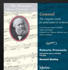
Gounod: Complete Works for pedal piano and orchestra. OSI / Shelley