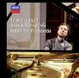
Liszt: Années de Pèlerinage, Deuxième Année, Italie - Deux Légendes