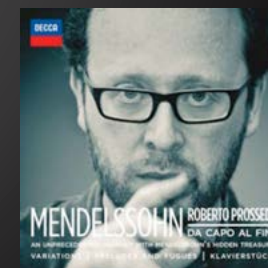
Da Capo al Fine. Preludes, Fugues, Variations, Unpublished Works