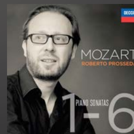
Mozart: Piano Sonatas No. 1-6