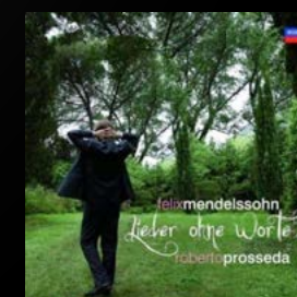
Mendelssohn: 56 Lieder ohne Worte, 4 Fugues, Allegro con Fuoco