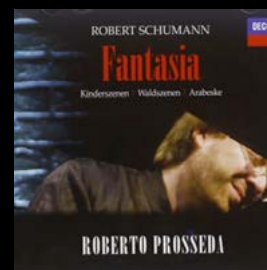
Schumann: Fantasia Op. 17, Arabesque Op. 18, Kinderszenen, Waldszenen