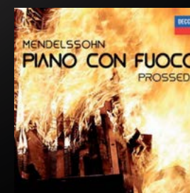
Piano con Fuoco. Mendelssohn's Sonatas, Fantasias, Capriccios