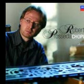
Chopin: Selected Piano Works: Nocturnes, Valses, Mazurkas, Ballade No. 4