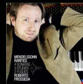
Mendelssohn Rarities. 4 Early Piano Sonatas (1820), 3 Etudes, 2 Fugues