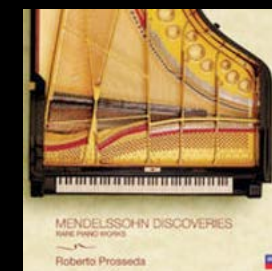
Mendelssohn Discoveries: Fantasia, Capriccio and other rare pieces