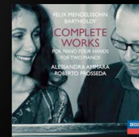
Mendelssohn: Complete Works for piano four hands and for two pianos