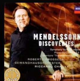
Mendelssohn: Piano Concerto No. 3, Gewandhaus / Riccardo Chailly